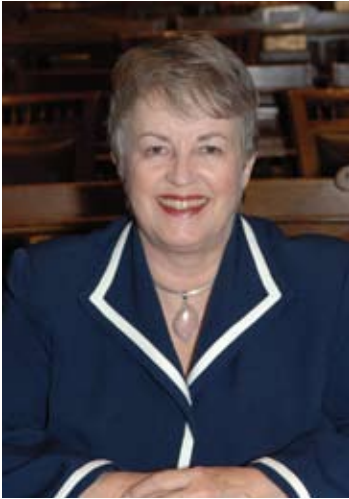
Nan Grogan Orrock Georgia Senate

Sen. Nan Grogan Orrock's 20 years in the Georgia legislature have included successful initiatives on family medical leave and equity for contraceptives. Orrock also sponsored the 1998 Chlamydia Screening Act (HB 1565). The act requires health insurers to cover an annual chlamydia screening test for women under age 30, which results in physicians routinely testing women at risk for the infection on a timely basis. Orrock credits the act's success to legislators' commitment to protecting the health of young women and obtaining strong evidence that chlamydia screening would save money and improve health in local jurisdictions across the state.